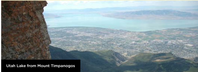
Utah Lake from Mount Timpanogos