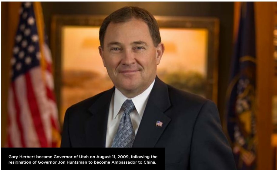
Gary Herbert became Governor of Utah on August 11, 2009, following the resignation of Governor Jon Huntsman to become Ambassador to China.

A PUBLICATION OF THE ECONOMIC DEVELOPMENT CORPORATION OF UTAH