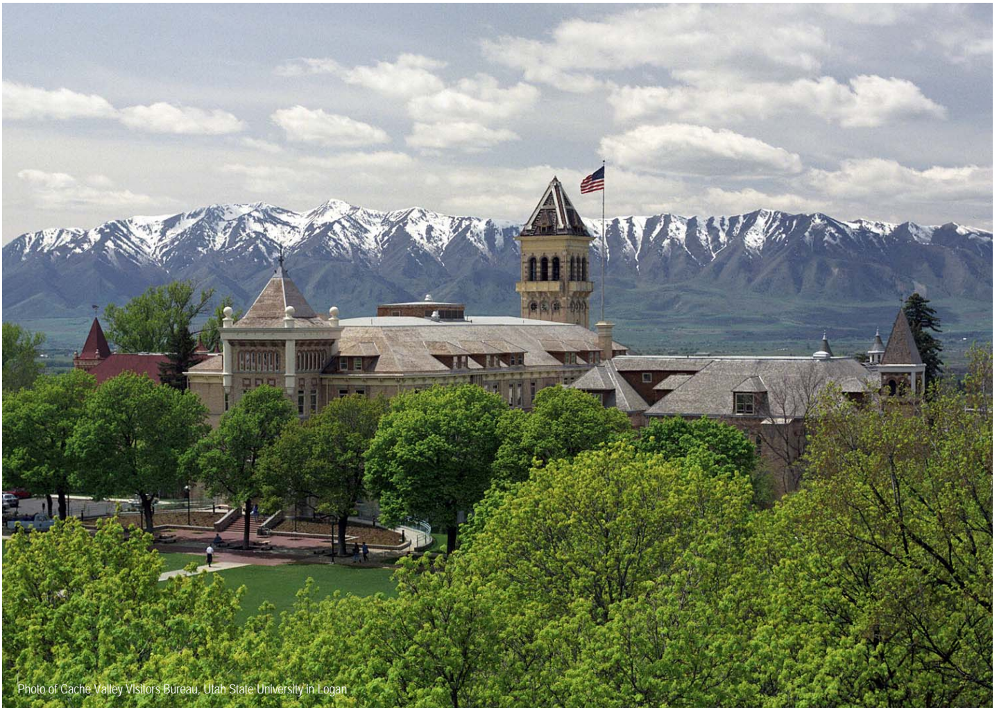
Photo of Cache Valley Visitors Bureau, Utah State University in Logan