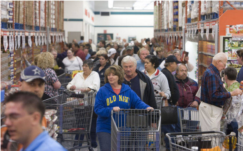
Large crowds of shoppers enter the new WinCo Foods that opened last year at 205 West 12th St. in Ogden. The company opened another store in Orem on the same day.