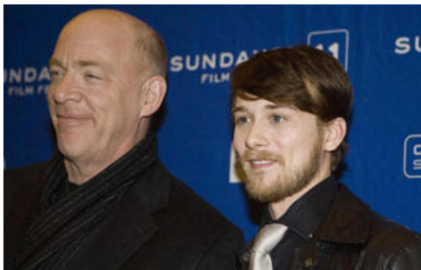
See all 6 photos | Click to enlarge

He was on hand to emphasize the point that Utah officially values the "cultural" and "significant financial impact" the festival makes each year. He might not have minded rubbing elbows with Dead guitarist Bob Weir and drummer Mickey Hart but he seemed pretty pleased to report some numbers too.